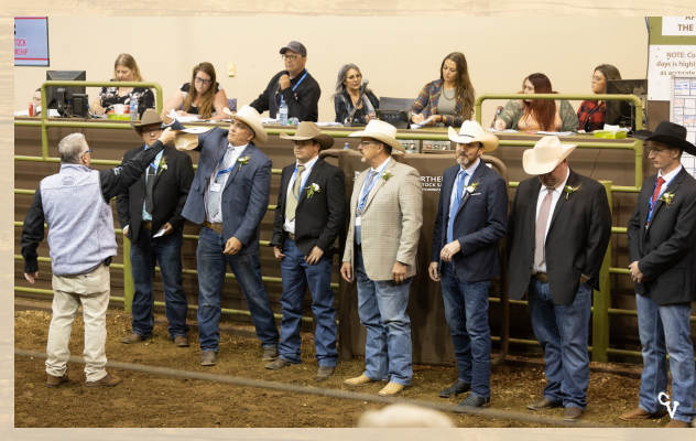
Top Ten Draw